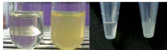
Color sample for chylous sample: 1,000FTU